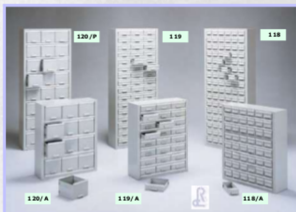
120/A 119/A 118/A